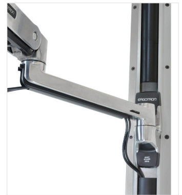
RECOMMENDED: ATTACH WALL MOUNT ARM TO AN ERGOTRON WALL TRACK USING BRACKET (#97-091)