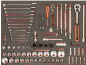
26" [543 x 445 mm]