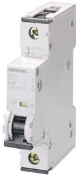
CIRCUIT BREAKER 230/400V 10KA, 1-POLE, C, 10A, D=70MM