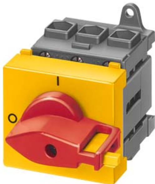
MAIN CONTROL SWITCH 3-POLE IU=32, P/AC-23A AT 400V=11,5KW BASE MOUNTING MOUNTING RAIL/TWO-HOLE MOUNTING KNOB BLACK