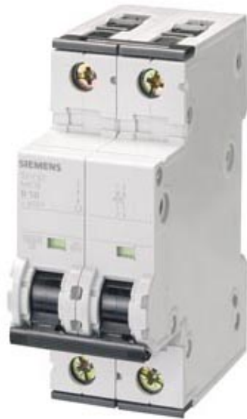
CIRCUIT BREAKER 400V 6KA, 2-POLE, C, 10A, D=70MM