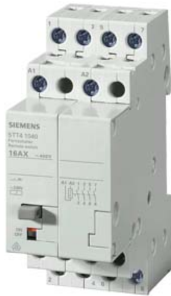
REMOTE SWITCH WITH 4 NO CONTACT FOR AC 230, 400V 16A CONTROL AC 230V