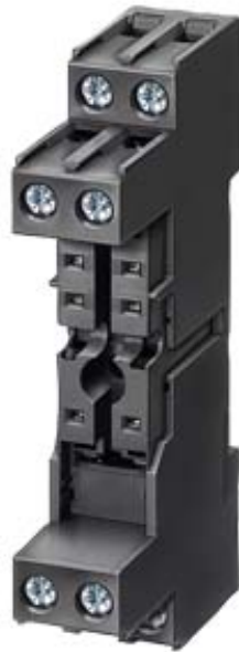
PLUG-IN RELAY, BASE 15MM