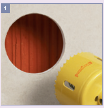
Hole cutter saw Ø67 Box Ø67 mm, more space for cabling