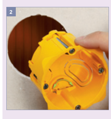
Retractable fixing claws for a better comfort during installation