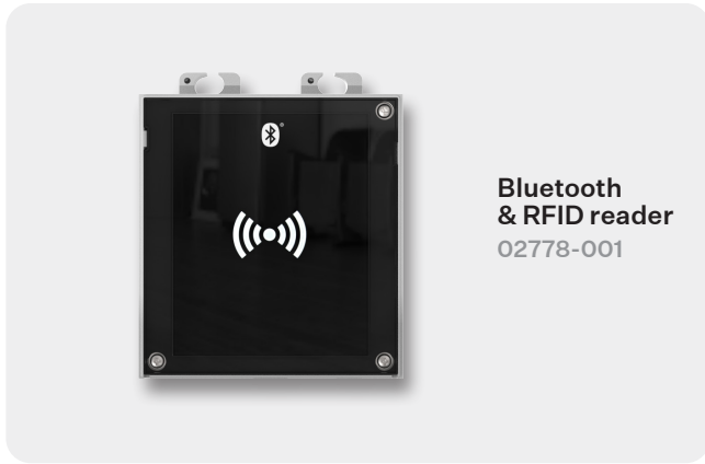
Bluetooth & RFID reader 02778-001