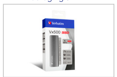
47444 Packaging 3D