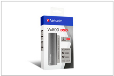
47454 Packaging 3D