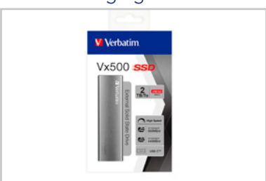
47454 Packaging Flat