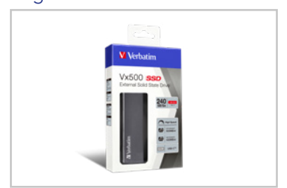
47442 Packaging 3D