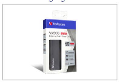
47443 Packaging 3D