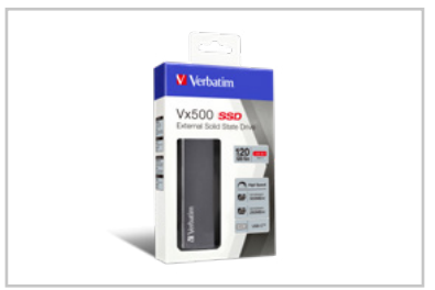
47441 Packaging 3D