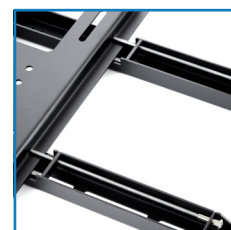
Security screws provide protection against accidental fall or unauthorised removal of a screen