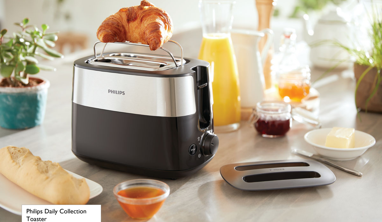
Philips Daily Collection Toaster