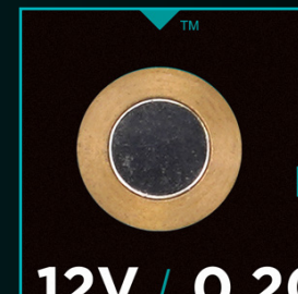
Rigid Brass Housing