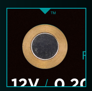
Rigid Brass Housing