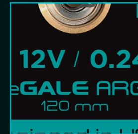
Rigid Brass Housing