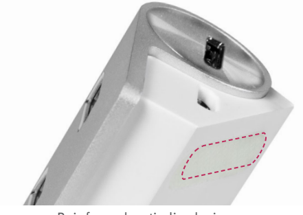
Reinforced anti-slip design