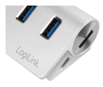
Stylish aluminum design