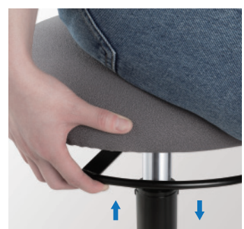
Height Adjustable Change the seat to the comfortable height.