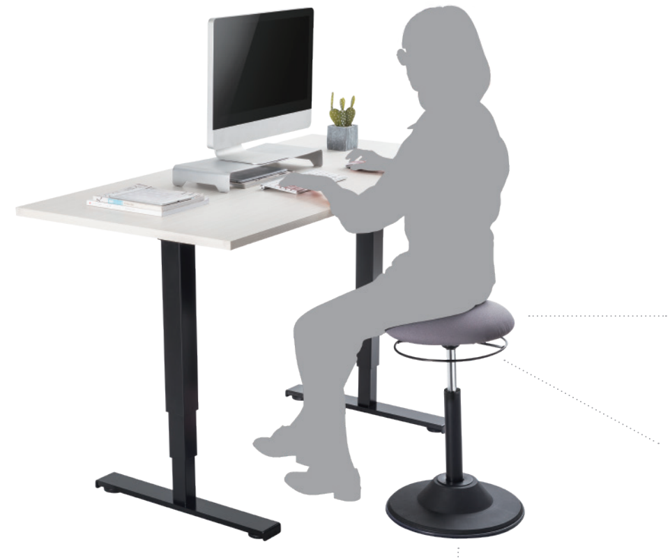
Wide Range of Motion 360° tilt, rotate and pivot.

A unique Adjustable Height Active Wobble Stool that completes your ergonomic and comforts as your work day.