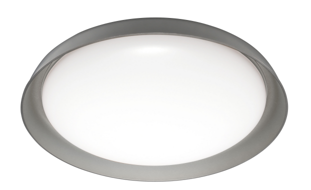
Plate | Decorative ceiling luminaires with WiFi technology