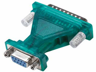
DB9 to DB25 adapter included