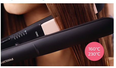
Choose from a temperature range from 160°C up to 230°C to secure long-lasting results while minimising the risk of hair damage.