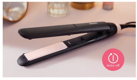
The styler has an automatic shut-off function for safe usage. It automatically switches off after 60 minutes.