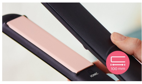
The longer 100 mm plates enable better contact with the hair to help you achieve perfect straightening results more easily and in less time.