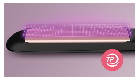
ThermoProtect technology distributes heat evenly across the plates, preventing overheating to protect your hair.