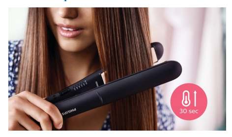
The straightener has a fast heat-up time, being ready to use in 30 seconds.