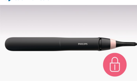
The plates can be locked together for safe and easy storage.