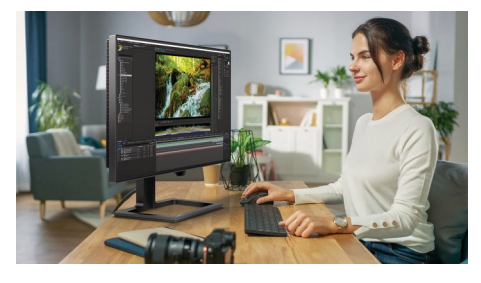
Philips displays meet TUV Rheinland Eye Comfort standard to prevent eye strain caused