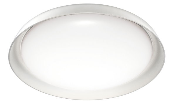
Plate | Decorative ceiling luminaires with WiFi technology