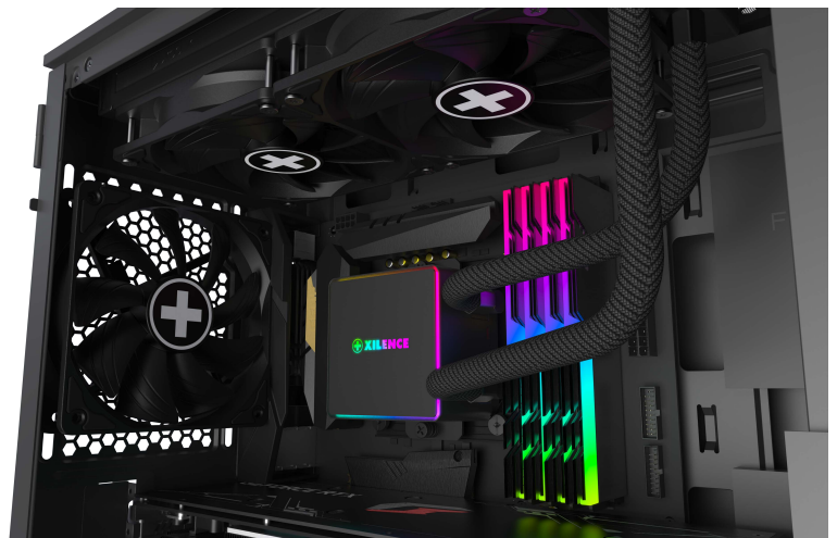
Example representation of the LQ240PRO water cooling system in a PC build.