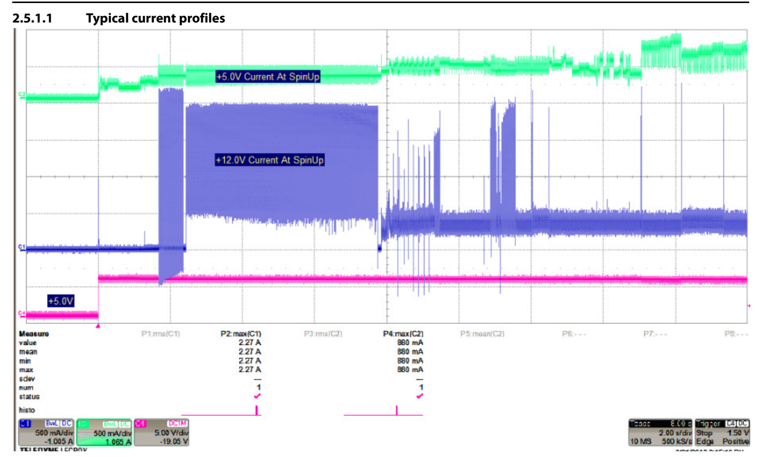
Figure 1. Typical 5V and 12V startup and operation current profiles