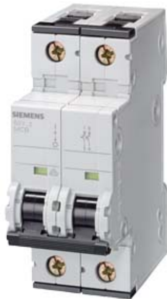
CIRCUIT BREAKER 230V 10KA, 1+N-POLE, C, 10A, D=70MM